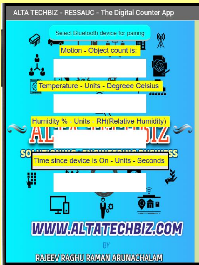
Sample Image of the App